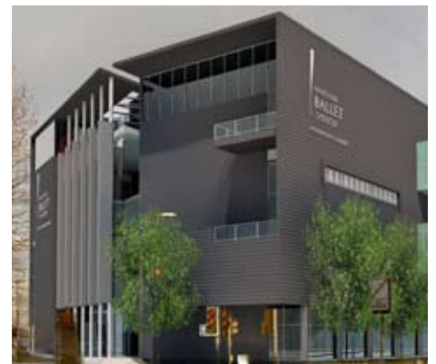
Northern Ballet Theatre's new headquarters are due to open in summer 2010

Momentum, the campaign to raise the remaining £1.5million of the £12million building, recently broke the £1million mark. Follow progress at www.building-momentum.co.uk