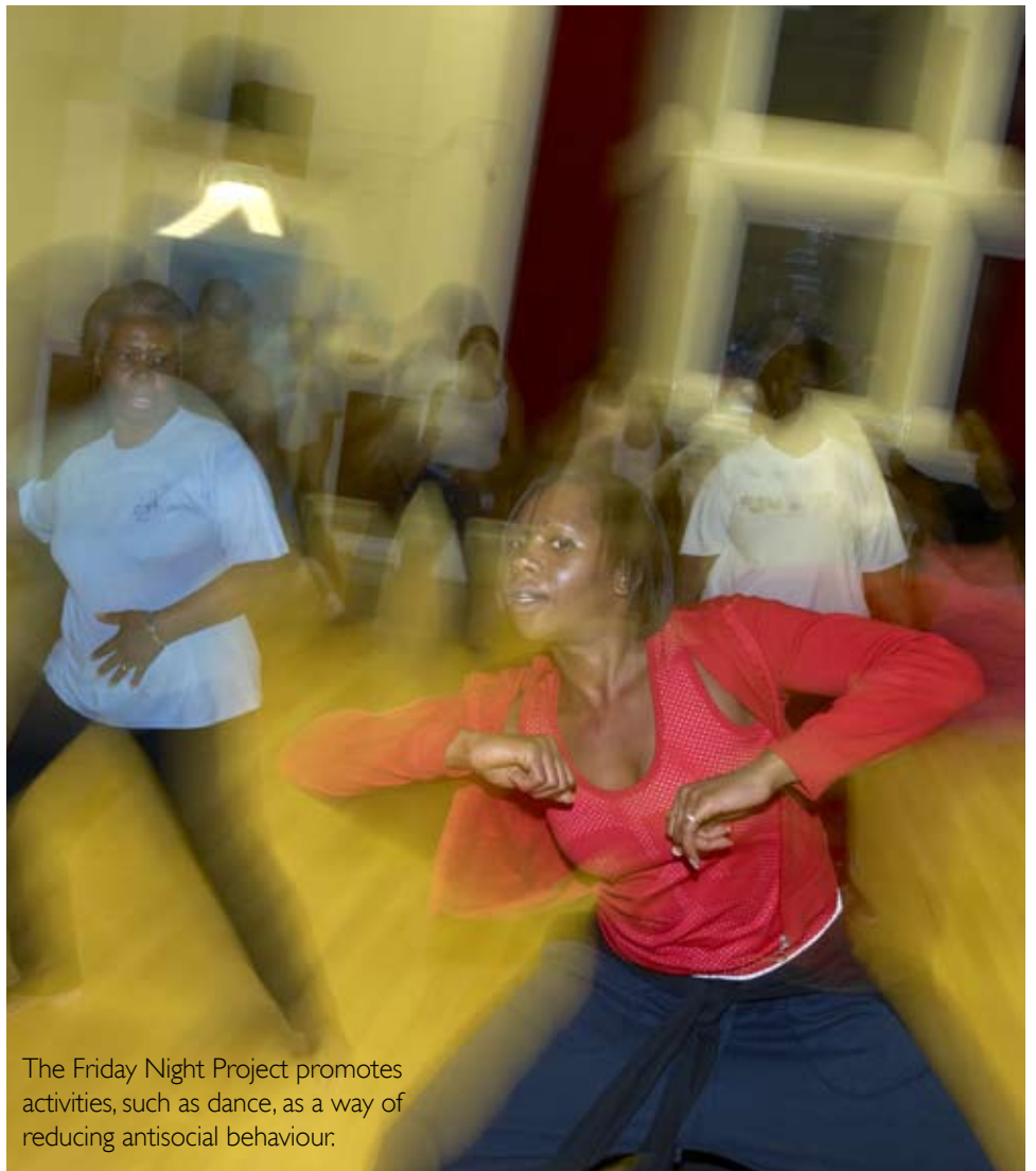
The Friday Night Project promotes activities, such as dance, as a way of reducing antisocial behaviour.