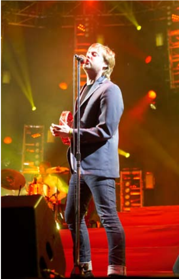
The new arena will attract world famous artists, including local band Kaiser Chiefs.

The arena was identified as a priority for the city in the Vision for Leeds 2004 to 2020, and was initiated by the Leeds Initiative’s Cultural Facilities Task Group.