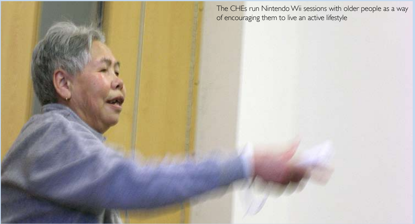
The CHEs run Nintendo Wii sessions with older people as a way of encouraging them to live an active lifestyle